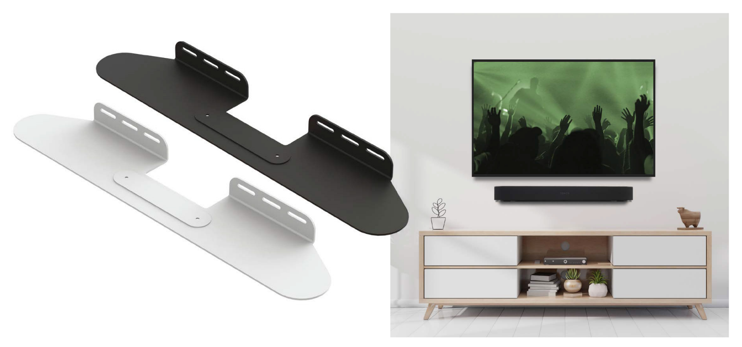
*Sonos is a registered trademark of Sonos Inc.Flexson is not affiliated with Sonos Inc.

Manufactured from steel and finished in either black or white this practical design will enable you to securely mount your Sonos Beam to your wall. There are two fixing points to make sure the Beam stays in place and plenty of access to route the cables you need.